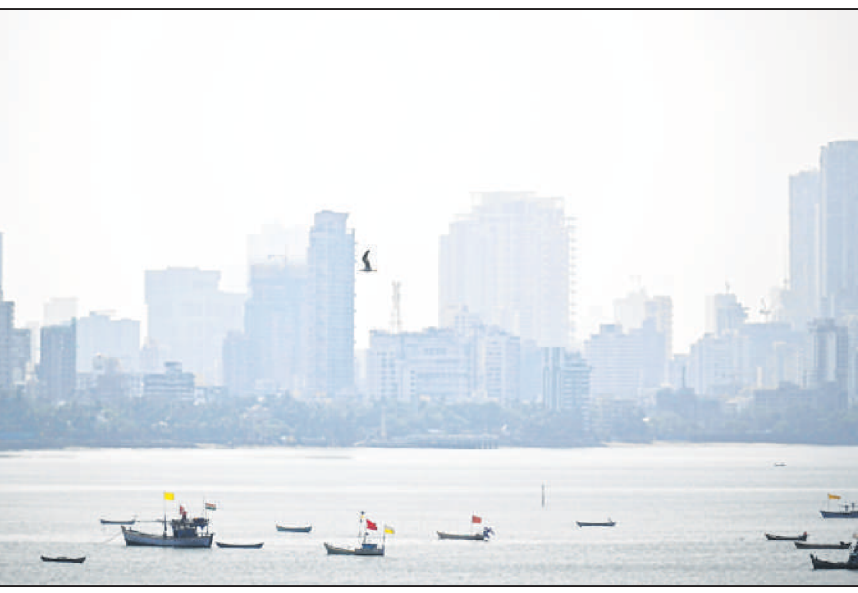
Mumbai's weekend started on a hazy note as smog covered the city's skyline